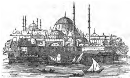
Mosque of Sultan Suliman.

next in point of beauty to that of St. Sophia, though far inferior in historical interest. At an early hour we